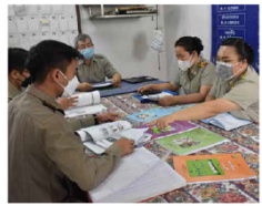
Teachers get to grips with the new primary school textbooks.

They will have a wide range of tools and techniques at their disposal, such as classroom observations, co-teaching, learning circles and more.