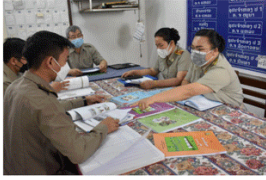
KPL | The Ministry of Education and Sports (MoES), with support from the Australian government through the Basic Education Quality and Access in the Lao PDR (BEQUAL) programme, is establishing a new nationwide system for teachers' Continuing Professional Development (CPD).

Internal Pedagogical Support team members were selected based on skills and experience and 50% are women.