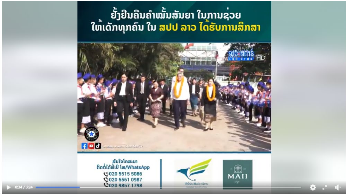
ລັດຖະບານອົດສະຕຣາລີ ຍັງຢືນຄົນຄຳໝັ້ນສັນຍາ ໃນການຊ່ວຍໃຫ້ເດັກທຸກຄົນ ໃນ ສປປ ລາວ