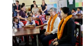
Minister Wong and Dr Sisouk Vongvichit also visited several displays prepared by the Research Institute for Educational Sciences and the Department of Teacher Education showcasing the educational and teacher training resources created with the support of the Basic Education Quality and Access in the Lao PDR (BEQUAL) programme.

They were pleased to see that in all classrooms, students were collaborating with each other, engaging with the learning materials and learning through experimentation.