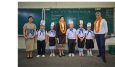
The Lao government and Australia have a long partnership in education sector development, most recently through the nationwide implementation of the new National Primary Curriculum that facilitates active learning and acquisition of 21st century skills.

For example, they were introduced to the materials used in the Spoken Lao Program that supports students who don't have Lao as their mother tongue.