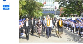
KPL Penny Wong, Australian Minister for Foreign Affairs, joined Dr Sisouk Vongvichit , Vice Minister of Education and Sports at a primary school in Vientiane on May 16.

They observed Lao Language and Science and Environment classes being taught using the new National Primary Curriculum teaching and learning materials, developed by Research Institute for Educational Sciences with the support of the Australian Government.