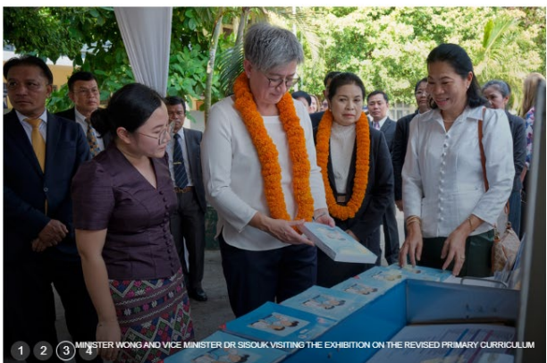
MINISTER WONG AND VICE MINISTER DR SISOUK VISITING THE EXHIBITION ON THE REVISED PRIMARY CURRICULUM

On 16 th May, Penny Wong, Minister for Foreign Affairs, Australia joined H.E Dr Sisouk Vongvichit, Vice-Minister of Education and Sports, Lao PDR at a primary school in Vientiane. They observed Lao Language and Science and Environment classes being taught using the new National Primary Curriculum teaching and learning materials developed by Research Institute for Educational Sciences with the support of the Australian Government. They were pleased to see in all classrooms, students were collaborating with each other, engaging with the learning materials and learning through experimentation.