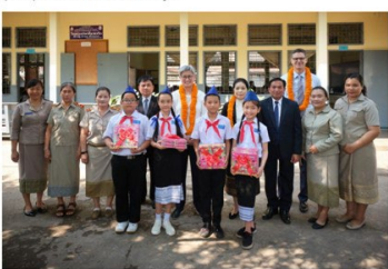
ສ່ອງ ທ່ານ ສິວ ວິຈິດ ມົນຕີ ກະຊວງການຕ່າງປະເທດ ສປປ ລາວ ສ່ອງ ທ່ານ ສິວ ວິຈິດ ມົນຕີ ກະຊວງການຕ່າງປະເທດ ສປປ ລາວ